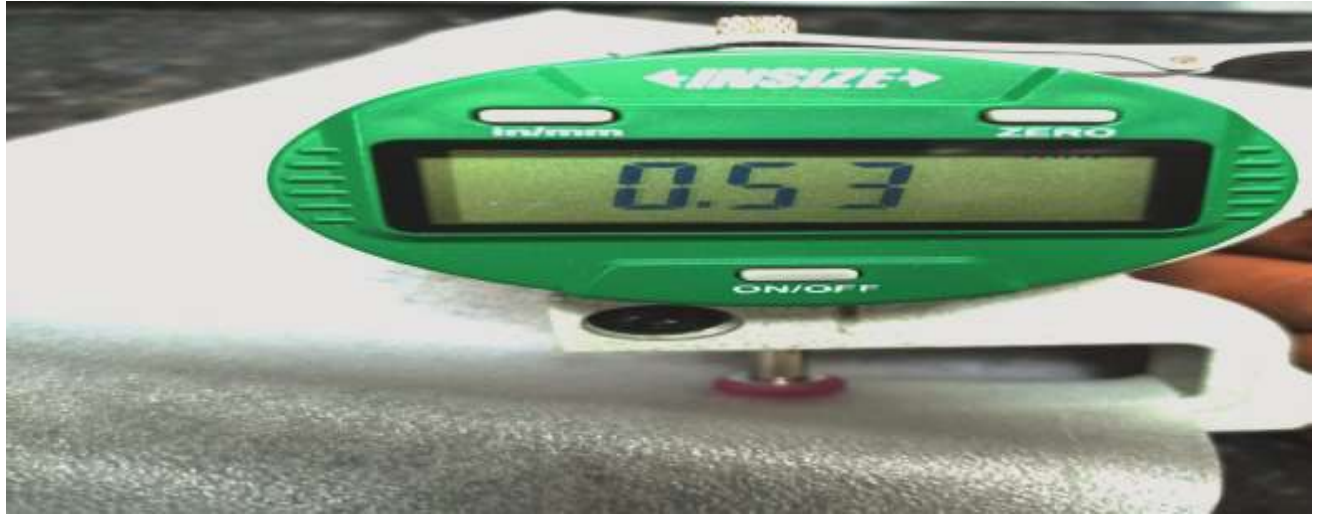
Fig. : Thickness Test of EVA Film

Test: The term “GSM” stands for “grams per square meter.” For this standard, the weight of EVA film is measured from a sample sheet cut to one square meter in size . No matter the length or width the film becomes, the weight measurement is always taken from the square meter film.