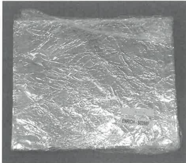
Photograph of sample as in received condition

Discipline: Mechanical Product Group: Rubber and Rubber Products